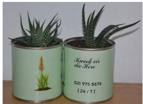
Each exhibitor gets a donated "Tarentaaltjie" or "Zebra" succulent plant to take home.