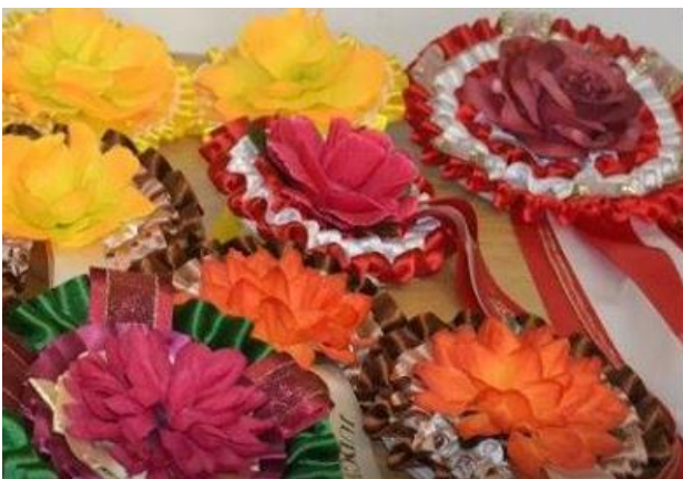
Rosettes sponsored by Rushfords Rosettes with flower additions by CDCi.

SAC@TS de-affiliated from SACC in 2013 with the decision to remain active as an independent club.